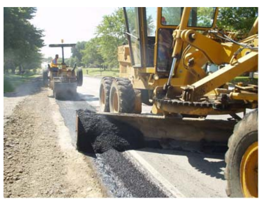
(9) Box Blade and Roller Operation