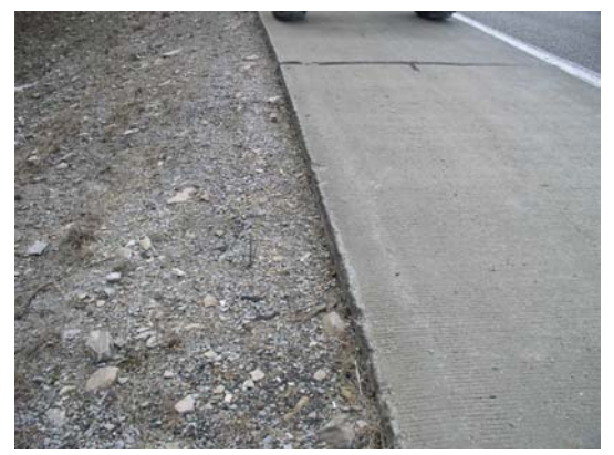
(11) Outside Shoulder Edge Prior to Edge Rut Repair