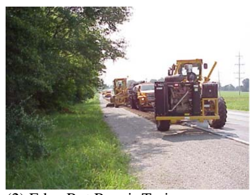
(2) Edge Rut Repair Train