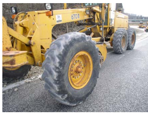
(14) Blading 2" Aggregate with Motograder