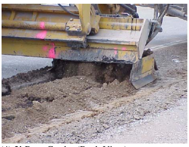
(4) 2' Roto Grader (Back View)