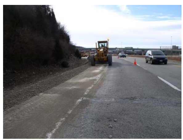
(15) Blading 2" Aggregate with Motograder