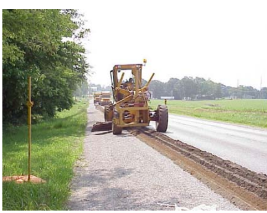
(5) Motor Grader Blade