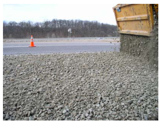
(12) Applying 2" Aggregate to Outside Edge of Shoulder