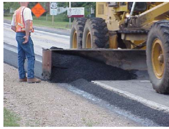
(8) Box Blading Hot Mix Asphalt