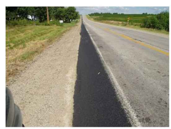
(10) Final Product