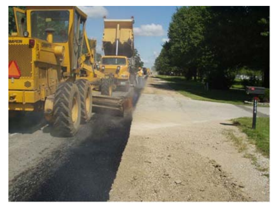
(7) Hot-Mix Lay Down