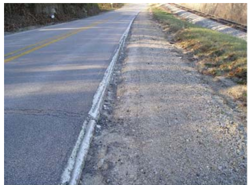
(1) Roadway Prior to Edge Rut Repair