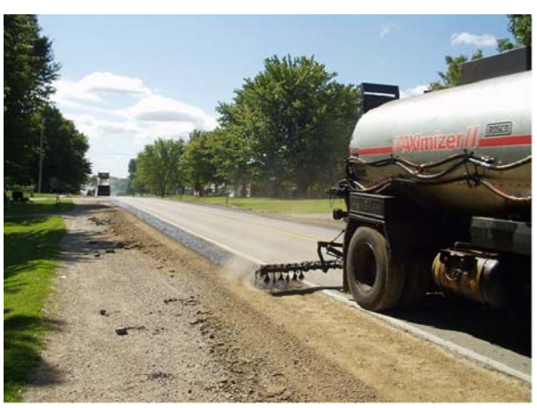
(6) Oil Distributor