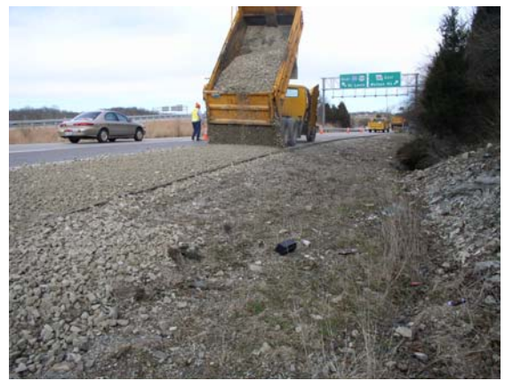
(13) Applying 2" Aggregate on Shoulder