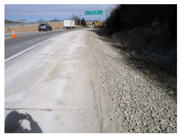
(17) Outside Edge of Shoulder – Finished Product