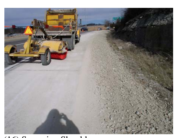
(16) Sweeping Shoulder