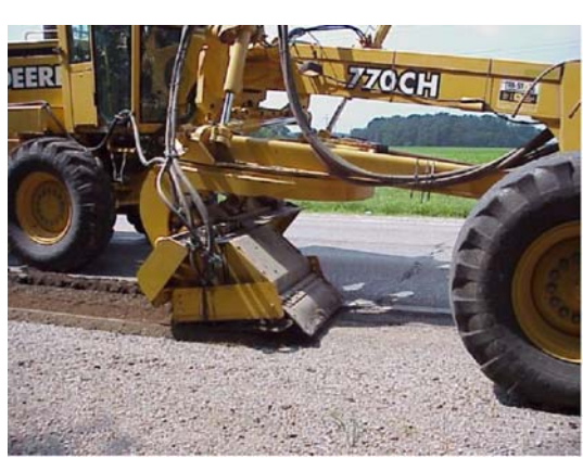
(3) 2' Head Roto Grader