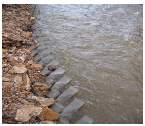
(8) Ajax Blocks Performing Under Full Flow Conditions