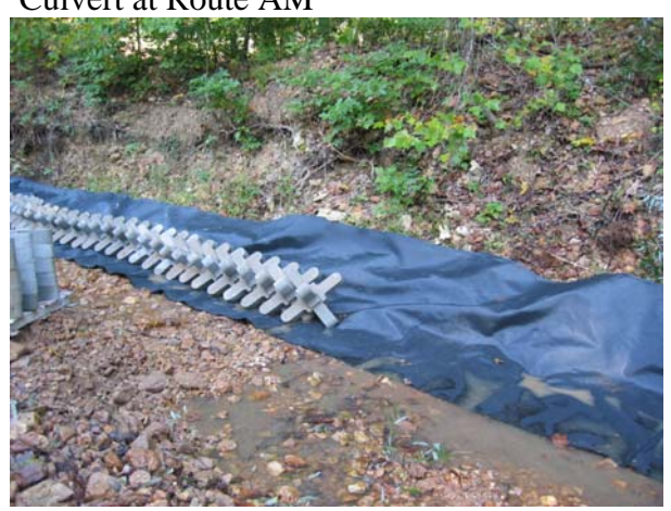
(5) Ajax Installation with Silt Blanket