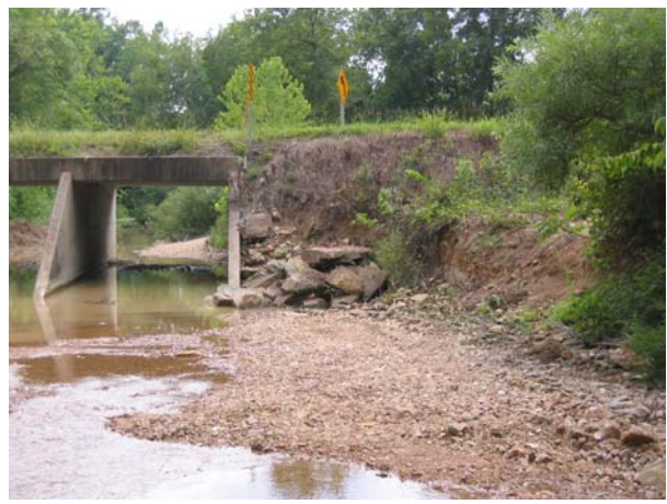
(1) Indian Creek -- Howell County Roadway Embankment Scour Upstream End