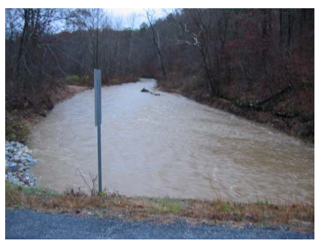
(2) Indian Creek – Upstream Full Flow Condition