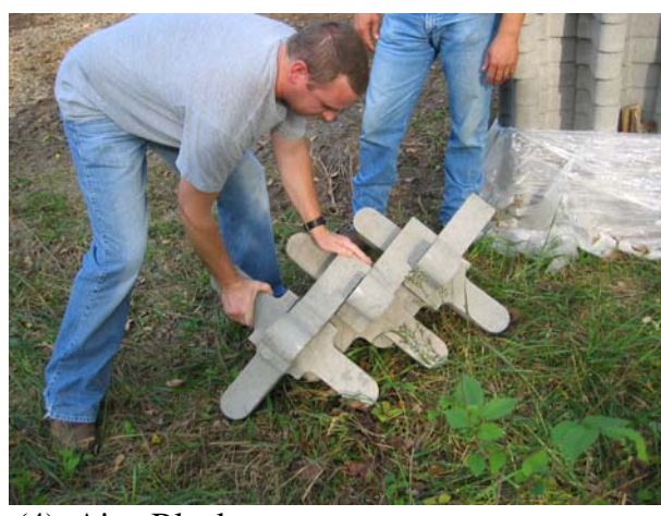
(4) Ajax Blocks