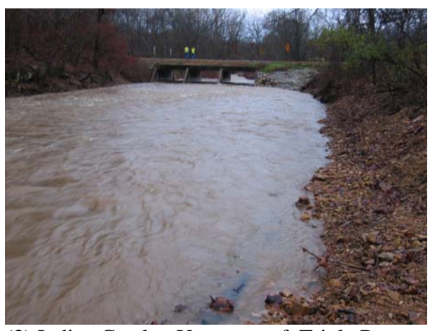
(3) Indian Creek – Upstream of Triple Box Culvert at Route AM