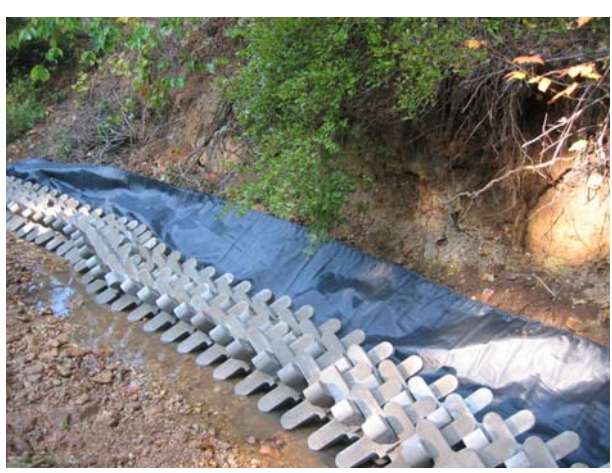
(6) Ajax Installation - Continued