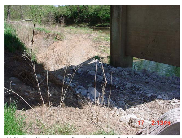
(10) Preliminary Grading for Gabions