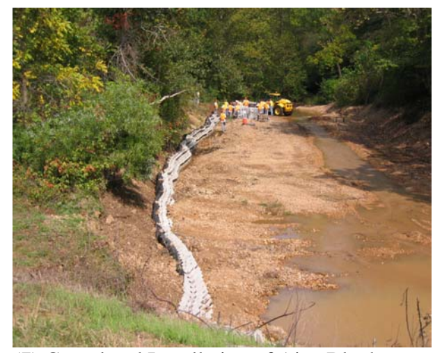
(7) Completed Installation of Ajax Blocks