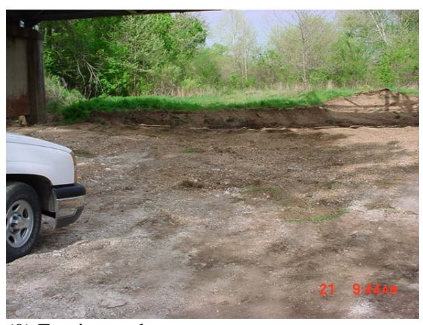
(9) Erosion under structure