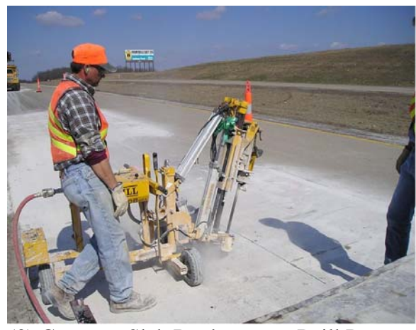
(3) Concrete Slab Replacement Drill Prep