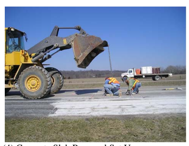
(4) Concrete Slab Removal Set Up