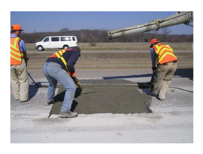
(10) Machine Finish Concrete with Bunion Tube