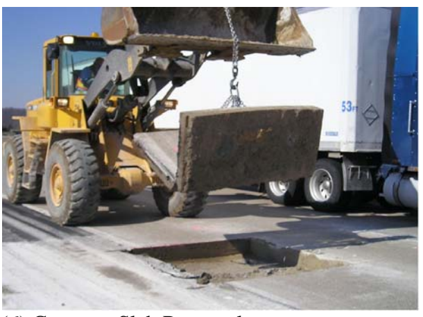
(6) Concrete Slab Removal