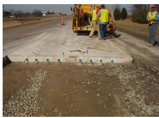
(8) Completed Dowel Installation