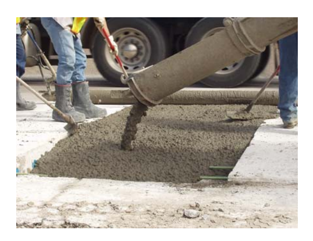
(9) Concrete Pour