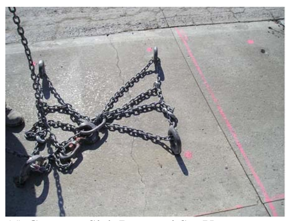
(5) Concrete Slab Removal Set Up