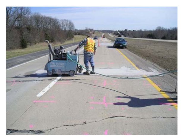
(1) Concrete Pavement Sawing