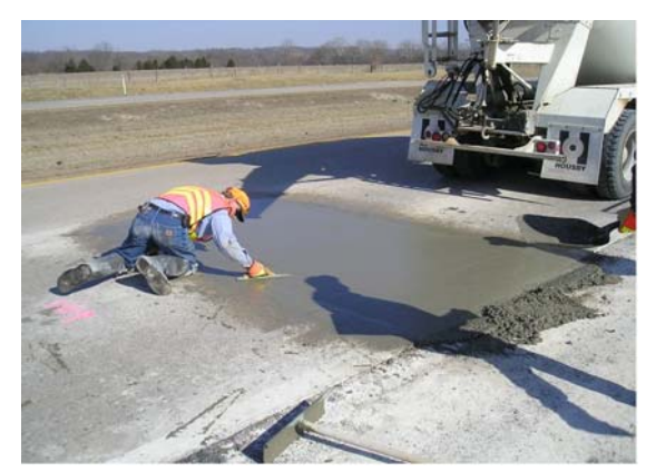
(11) Concrete Hand Finish