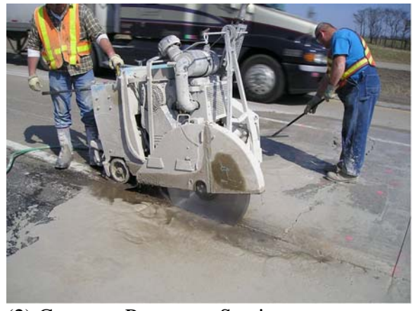
(2) Concrete Pavement Sawing