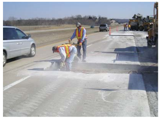
(7) Dowel Installation