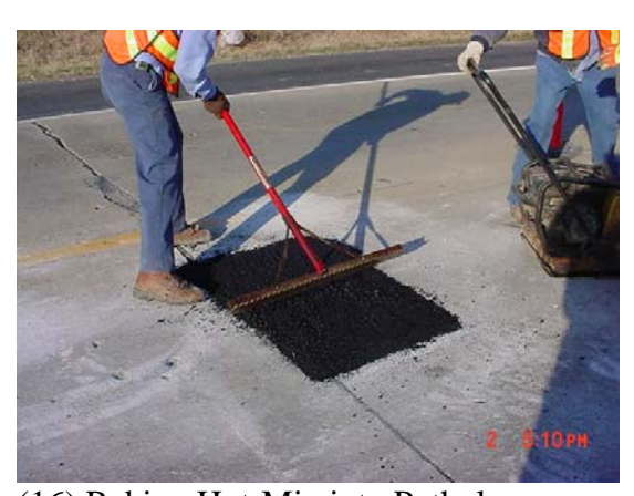
(16) Raking Hot-Mix into Pothole