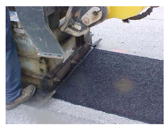
(5) Finishing Partial Depth Asphalt Patch (6) Finished Product