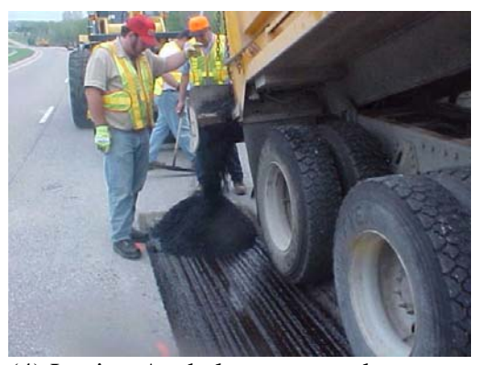
(4) Laying Asphalt on prepped area