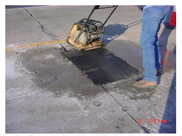
(17) Compacting Hot Mix Patch