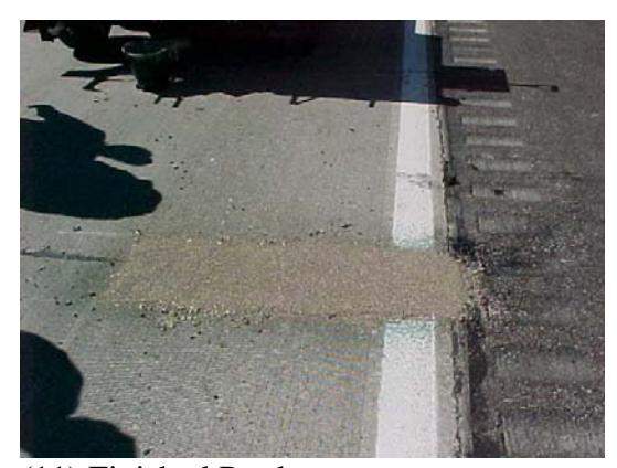
(11) Finished Product