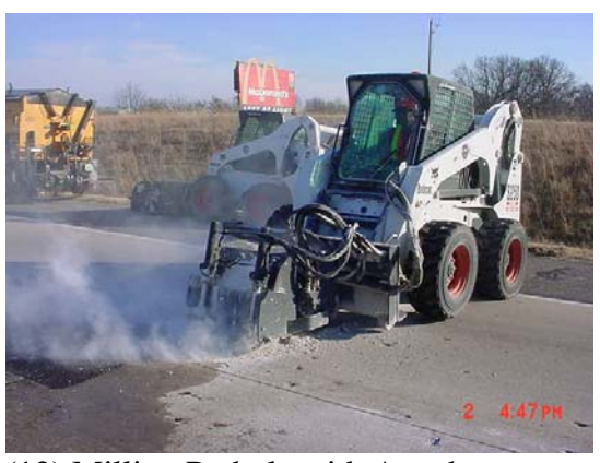
(12) Milling Pothole with Attachment