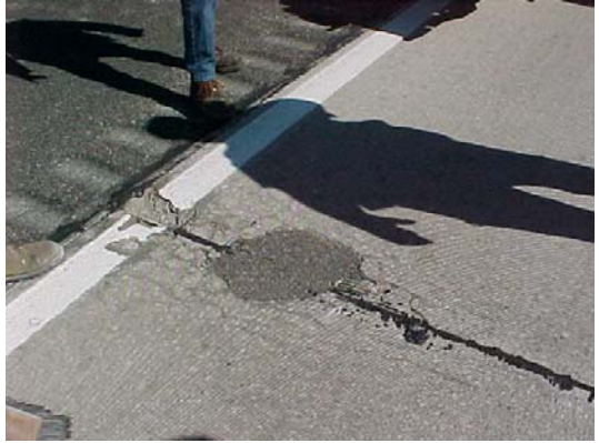
(7) Deteriorated Concrete Joint/Spall