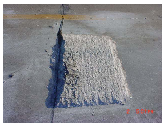
(15) Prepped Pothole