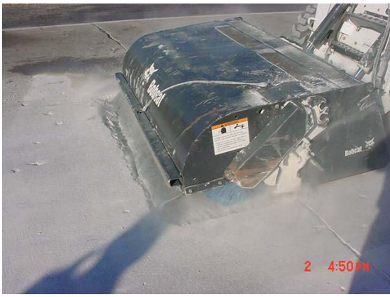
(14) Sweeping Concrete Pavement Pothole