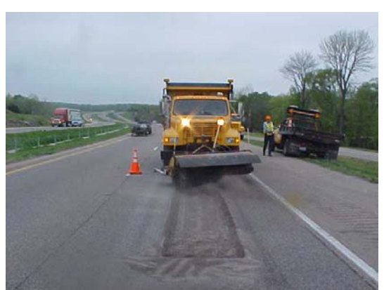
(3) Sweeping a section of partial depth milled asphalt