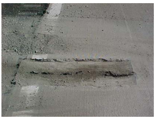
(9) Prepped Pothole Prior to Patching