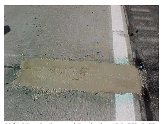
(10) Newly Poured Pothole with High Type Patching Material