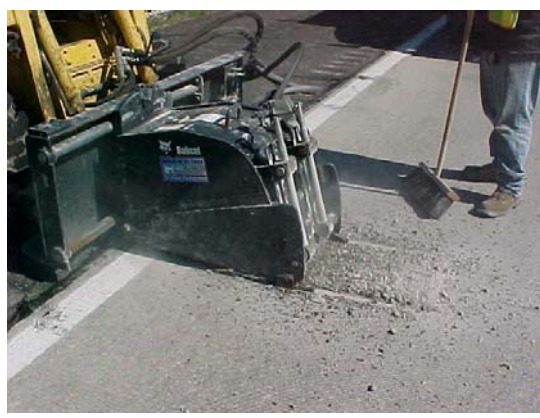
(8) Preping Pothole with Milling Attachment