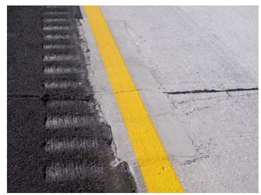
(1) Permanent Partial Depth Patch