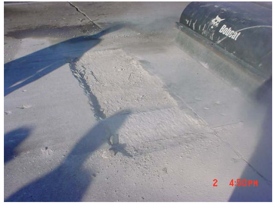
(13) Milled Concrete Pavement Pothole