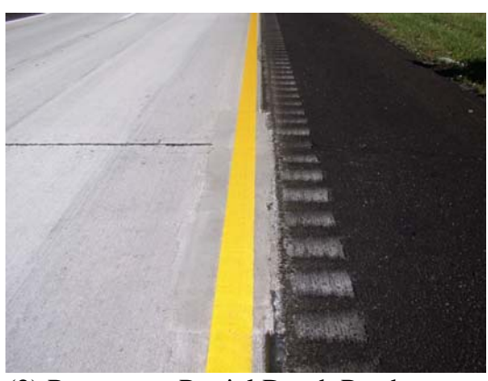
(2) Permanent Partial Depth Patch