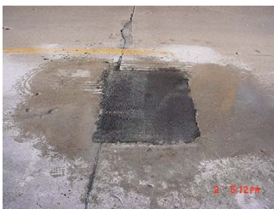
(18) Finished Product