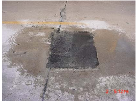
(18) Finished Product