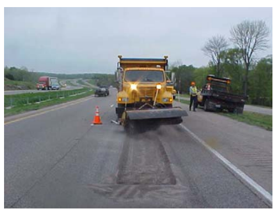
(3) Sweeping a section of partial depth milled asphalt