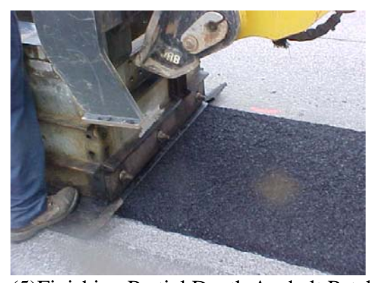
(5) Finishing Partial Depth Asphalt Patch (6) Finished Product