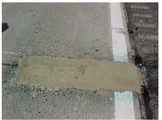
(10) Newly Poured Pothole with High Type Patching Material