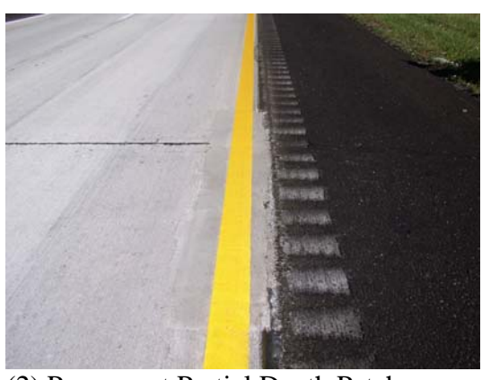
(2) Permanent Partial Depth Patch