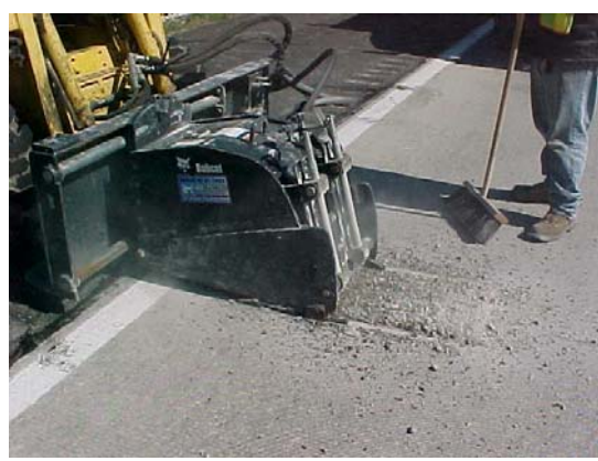
(8) Preping Pothole with Milling Attachment