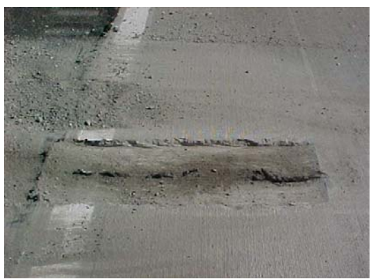
(9) Prepped Pothole Prior to Patching