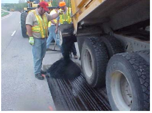
(4) Laying Asphalt on prepped area