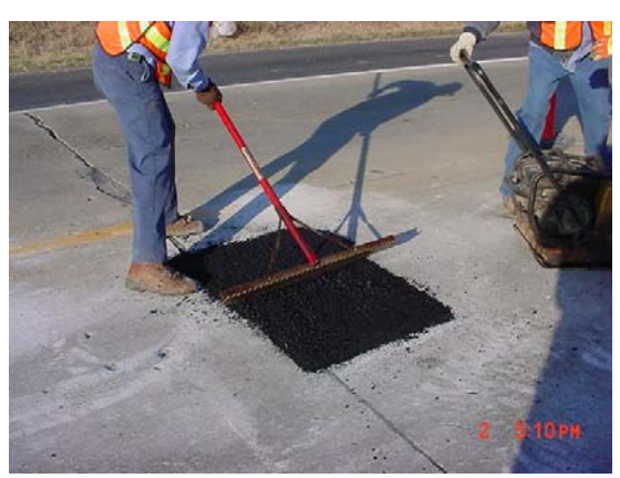
(16) Raking Hot-Mix into Pothole