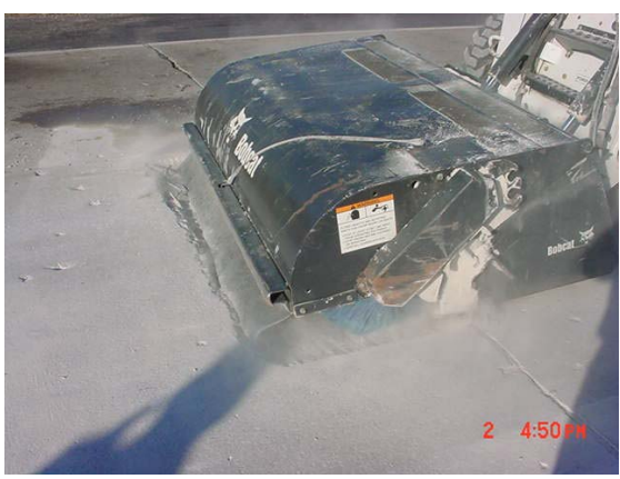
(14) Sweeping Concrete Pavement Pothole