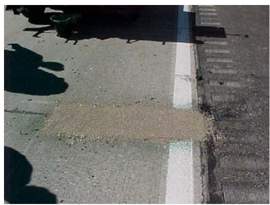
(11) Finished Product