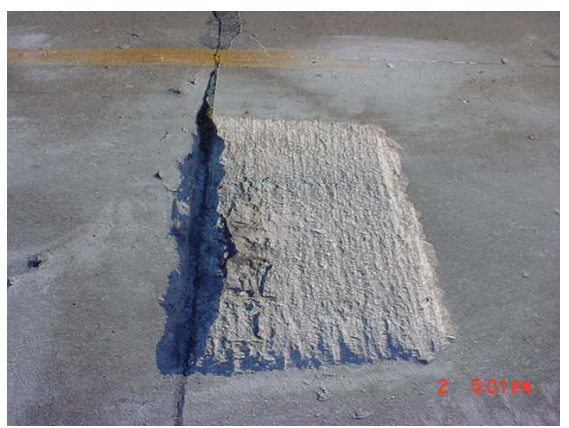
(15) Prepped Pothole