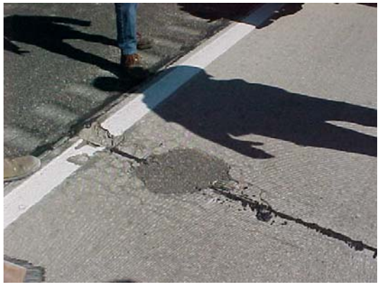
(7) Deteriorated Concrete Joint/Spall