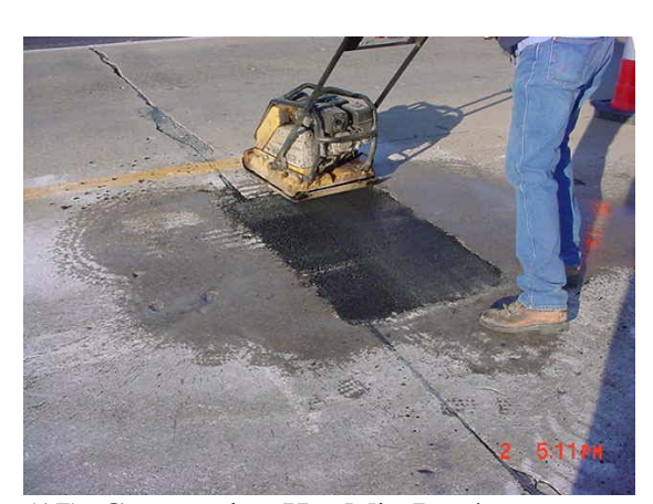
(17) Compacting Hot Mix Patch