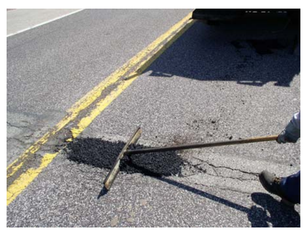
(13) Leveling Pothole Patch