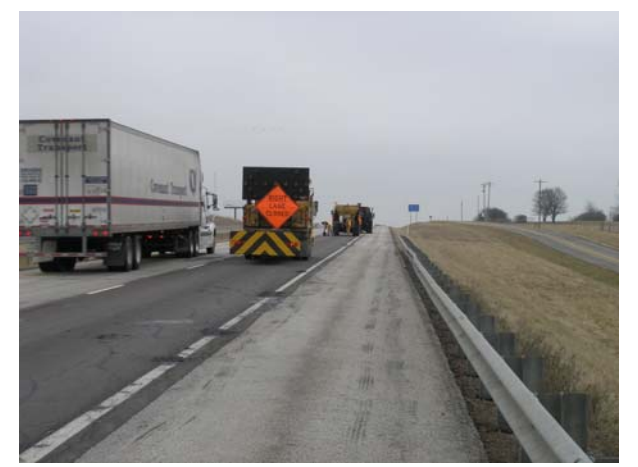
(1) Pothole Patching