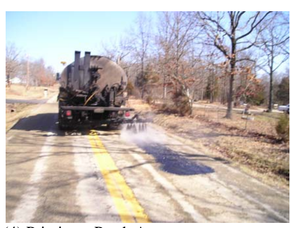
(4) Priming a Patch Area