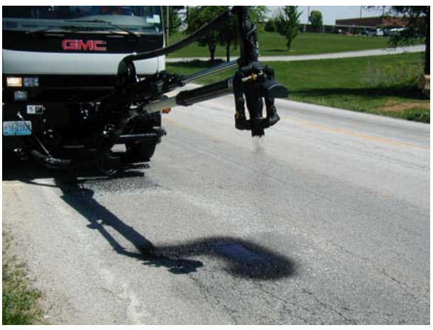
(8) Injection Patcher Application