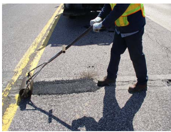
(14) Hand Rolling Pothole Patch