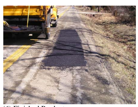
(6) Finished Product