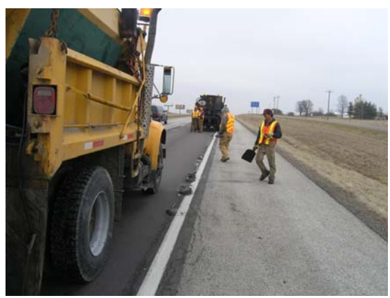
(3) Pothole Patching