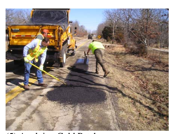
(5) Applying Cold Patch