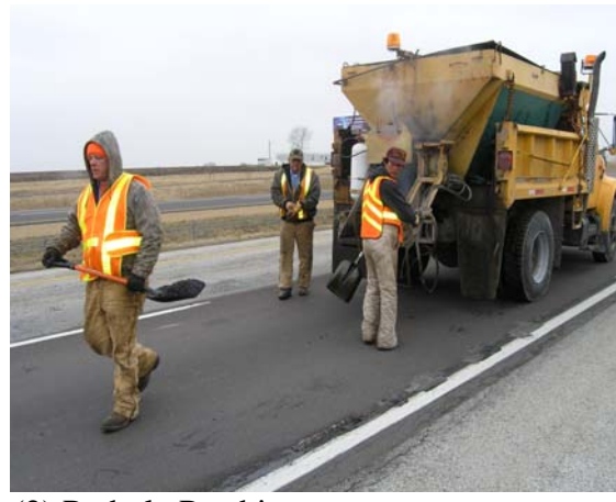
(2) Pothole Patching