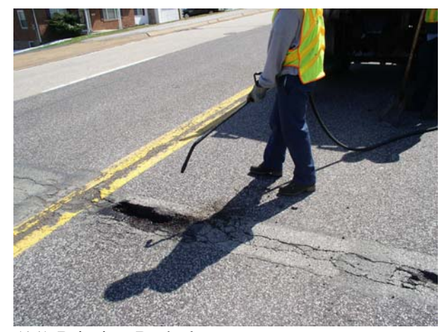
(11) Priming Pothole