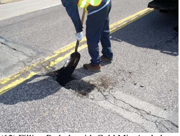
(12) Filling Pothole with Cold Mix Asphalt