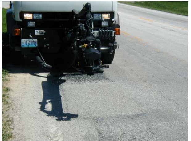
(7) Injection Patcher Set Up