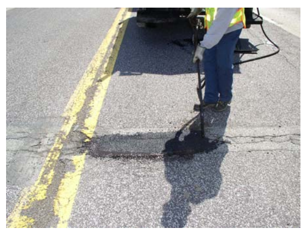
(15) Sealing Pothole Patch