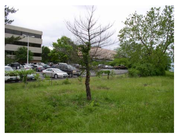
(1) Undesirable tree located on right of way