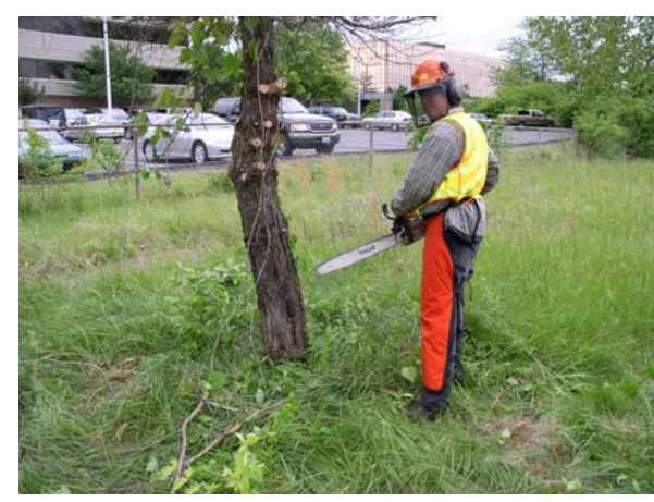
(2) Pruning tree trunk prior to removal