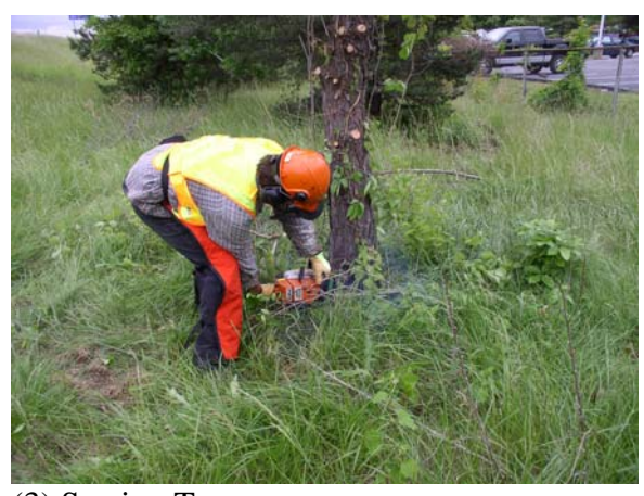
(3) Sawing Tree