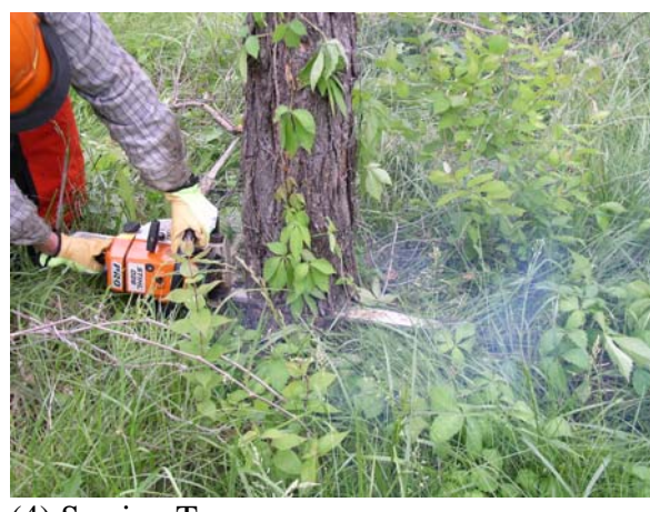
(4) Sawing Tree