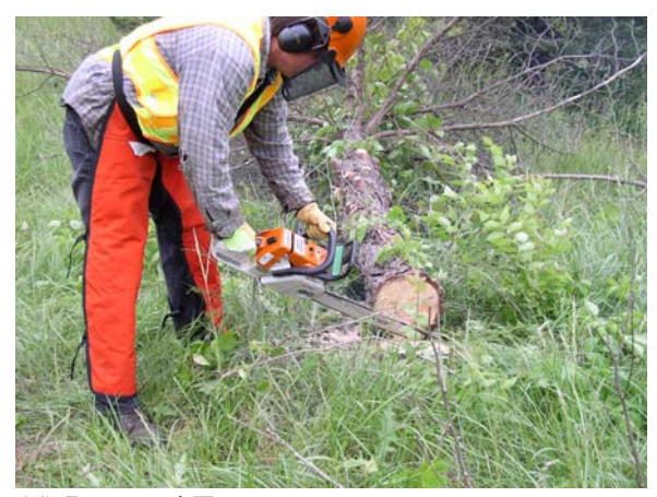
(5) Downed Tree