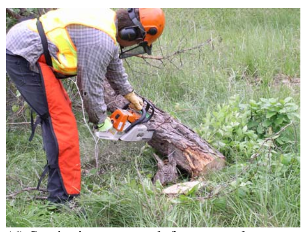
(6) Sectioning tree trunk for removal